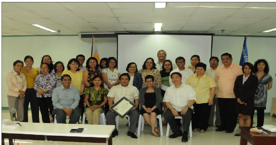
Members of the PMS Management Committee who attended the CESPES Orientation on September 7, 2011.